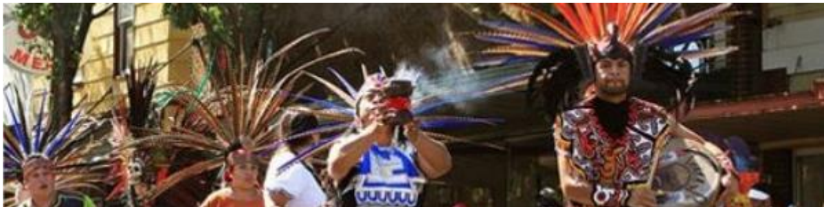
Plate of Nations in Southeast Seattle - March 23-April 8